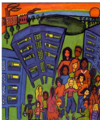
FKCLC facilitated an effective collaborative

FKCLC has won this year's Tim McCoy Award for outstanding achievement in human rights advocacy and justice for Somalian Youth in Flemington.